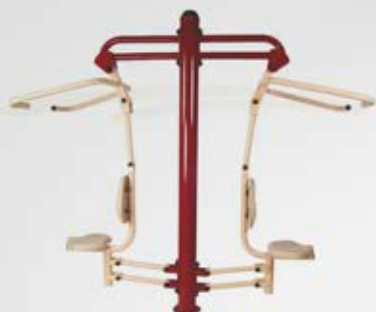
PULL DOWN CHALLENGER