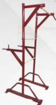
DIPS/CHIN UP/PULL UP