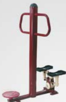
STEPPER WITH TWISTER