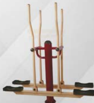
DUAL SKY STEPPER